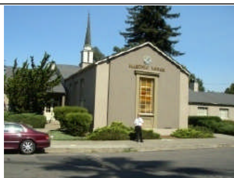
First LDS Church in Santa Rosa